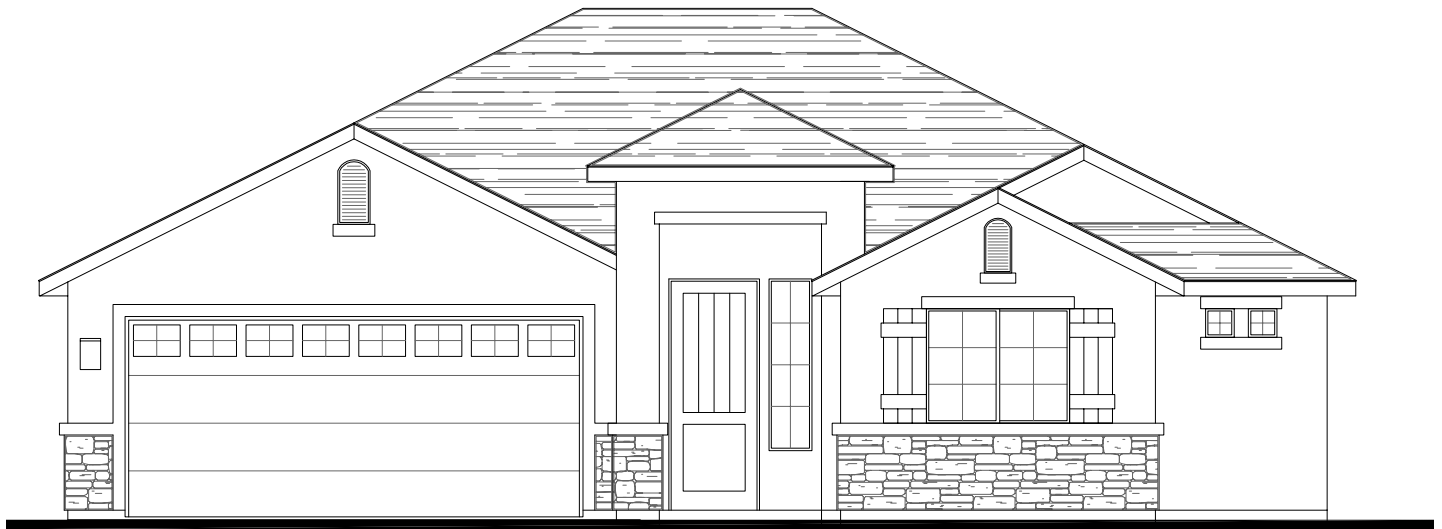
ELEVATION OPTION B