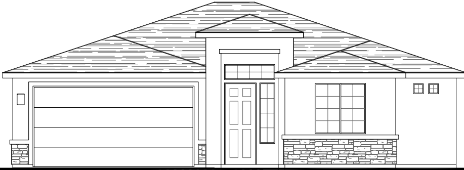
ELEVATION OPTION A