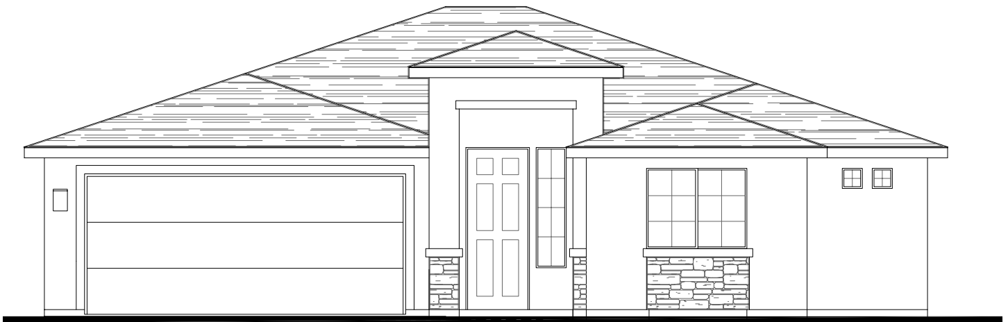
ELEVATION OPTION C