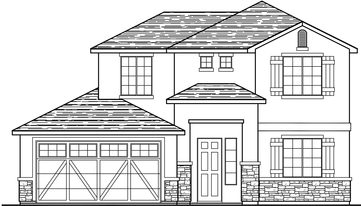
TAMARISK ELEVATION OPT "B"